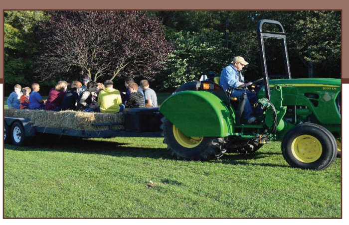
Sunday school hayride

What greater blessing could we ask for? "Faith comes by hearing, and hearing by the word of God." (Romans 10:17) At Faith we eagerly look forward to the future, rejoicing in our Lord's continued presence and blessing, "Lo, I am with you always, even to the end of the age." (Matthew 28:20)