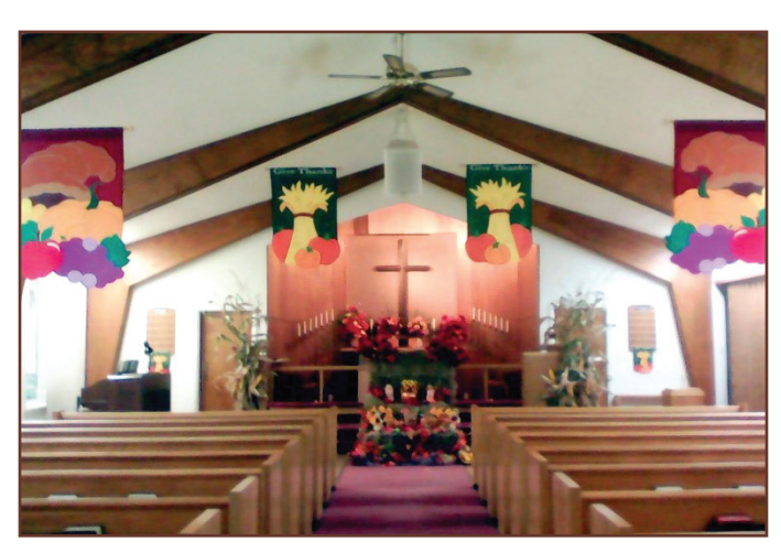
Sanctuary decorated for Thanksgiving

At Faith we're excited to see the Lord's will unfold in our