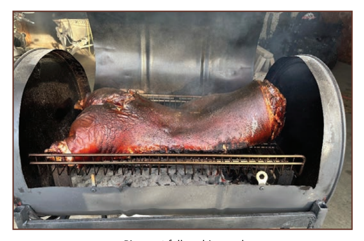
Pig roast fellowship meal