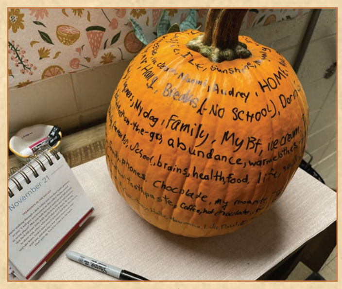
Girls dorm thankfulness pumpkin

College Visitor's Day was a great success again this year. Faculty members offered presentations on such subjects as "Topology," "Greek: The Bible in High-Def," introductions to the Education and Pre-Theology Programs, and "Why Should I Come to Immanuel for College?" A highlight of the day was the presentation