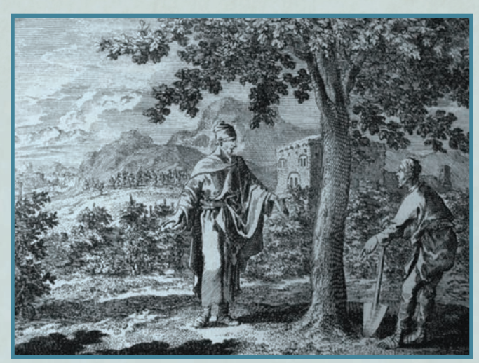
The Barren Fig Tree, by Jan Luyken

Our parable (Luke 13:6-9) presents a fig tree planted as the centerpiece of a vineyard. Figs were the highly prized sugarcrop of the day. Fig trees were time- and resource-intensive, so if one proved barren, it was to be summarily removed.