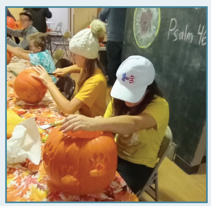
Fall Party 2023

A typical Sunday includes the service at 10:00 A.M., preceded during the school year by Sunday school and Bible class at 9:00 A.M. We cycle through three of the liturgies found in the Lutheran Hymnal and the Supplement every month. More and more Bible classes have taken place in the parsonage, to allow for slide shows and an occasional round of "Bible Class Jeopardy." During Advent and Lent, we have evening services on Wednesdays at 7:00 P.M. If you find yourself in Sioux Falls, be sure to head on over. We would love to have you!