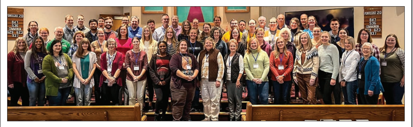
Attendees at the CLC Teachers' Conference, held October 18-20, 2023 at Berea Lutheran Church in Inver Grove Heights, Minnesota.