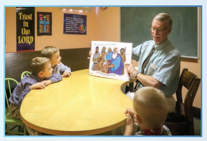
A Sunday school class at Faith Lutheran Church

I've intentionally thrown a lot of numbers at you so far, which might