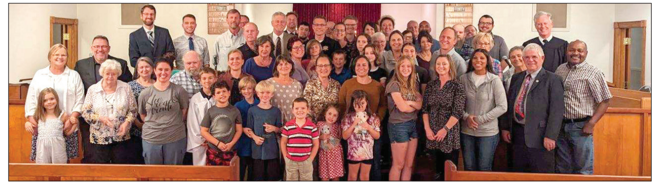
Pastors of the SE Pastoral Conference, along with members of the hosting congregation, Trinity Lutheran Church of West Columbia, South Carolina. The conference was held September 26-28, 2023.