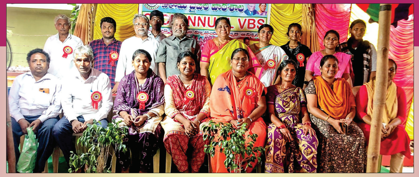
Teachers, organizers and helpers at CLCI VBS 2023

program, Bible quiz programs, Bible written tests, Bible storytelling competitions, coloring of Biblical pictures, coloring of plaques made by plaster of Paris, and song competitions. The children present all these programs and participate in all the major events of the VBS. Much blessing has followed in the lives of our CLCI children through this annual VBS-2023.