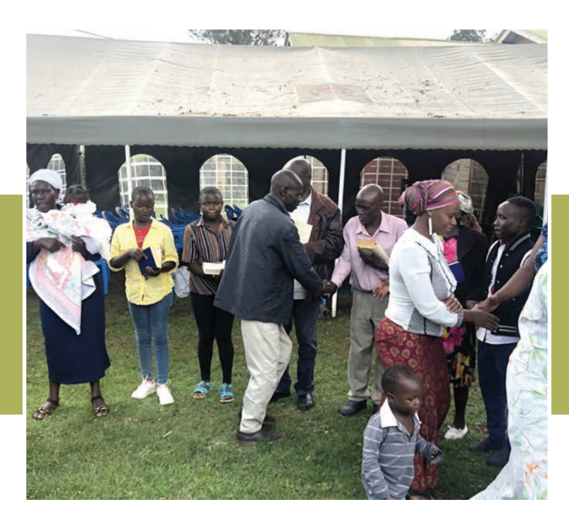
Fellowship and greetings after church.

A typical Sunday morning at church in rural Kenya doesn't involve a last-minute rush. While waiting for everyone to make their way to divine service, hymns are sung, conversations are had, and prayers are offered up. After the service is over, no one is in a hurry to go anywhere. It may be time to fellowship or share tea and more lengthy conversation.