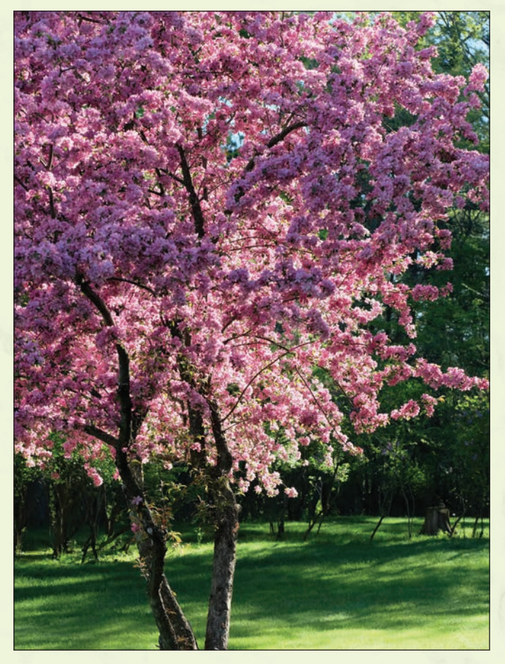
Flowering cherry tree in spring

We certainly appreciate the hard work and dedication that Paul and Brett demonstrate year-round in keeping our campus operating smoothly and looking great. One recent, first-time visitor to campus marveled about how beautiful everything looked and noted that you can