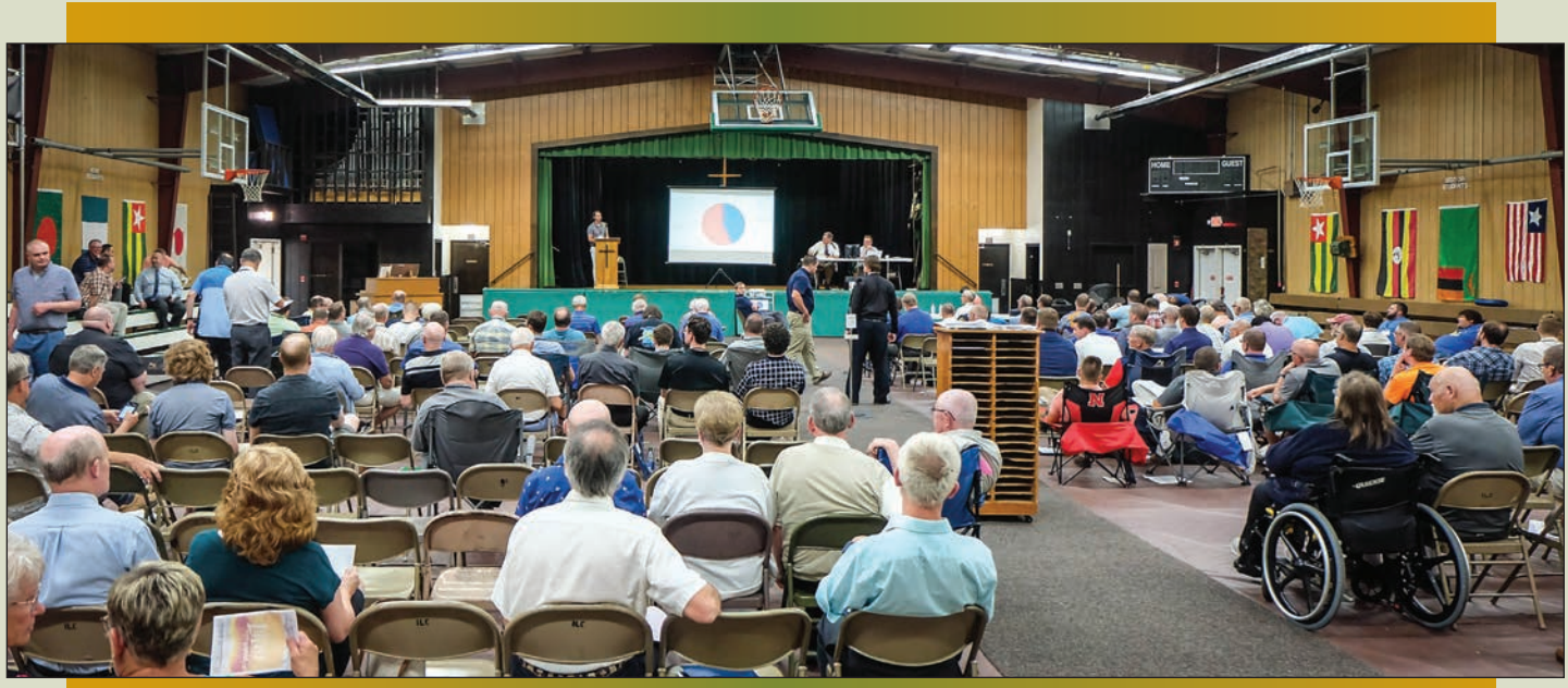
Floor sessions met in the fieldhouse of Immanuel Lutheran College.

In order to fund such support, the convention resolved "that we establish a Fund for Christian Education to be administered by the CLC Board of Trustees at the direction of the BoEP and for the purpose of assisting CLC congregations in the establishment of Christian Day Schools." This new fund was started with $4000 from the CLC Foundation, which was dissolved.