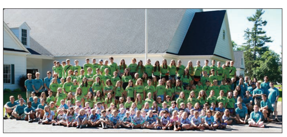
CLC Youth Camp attendees.

The campus is host to many events during the summer. The 35th CLC Convention, as well as the CLC Youth Camp and camps for volleyball and girls' and boys' basketball were held at ILC. The professors all participate as delegates at the convention, but the faculty, and especially the staff, put in work before and after the convention ensure everything to on the campus runs as