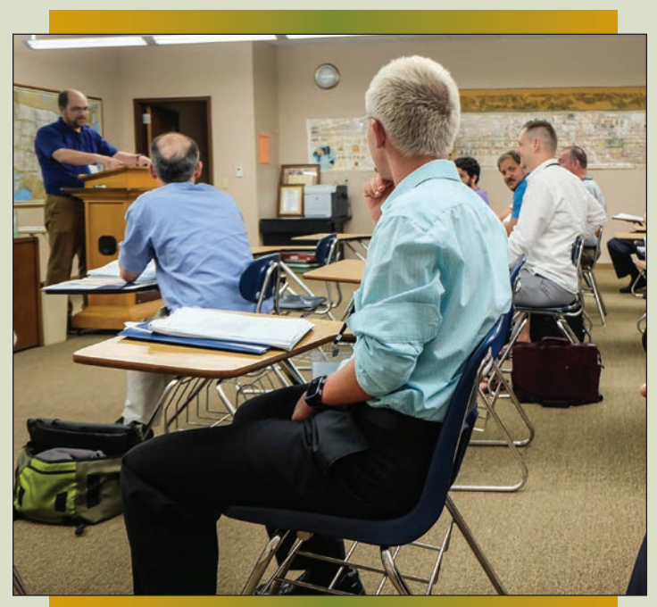
Floor Committee #3 meeting in an Academic Center classroom.

seek input from the Board of Doctrine in doctrinal discussions with other church groups." The convention directed the Standing CLC Constitution Committee to amend the Constitution to reflect the above resolution and present the amendment to the 2024 Convention.