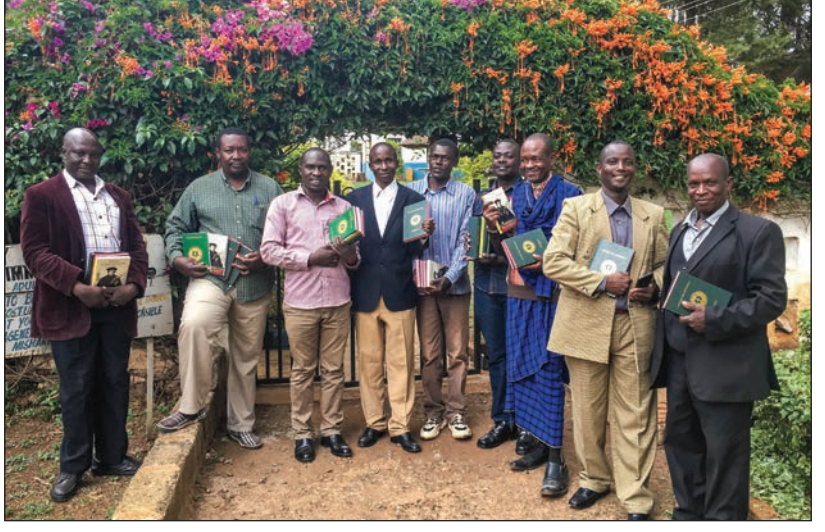
2022 Kenya/Uganda Bible Conference at Soy Safari Resort.

Such a conference is not quite comparable to the pastoral conferences among us, where each pastor has a different paper to present or duty to perform. The Kenya/Uganda Bible Conference could be better