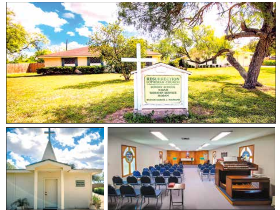
Top: Resurrection Lutheran Church, Corpus Christi, Texas. Bottom left: The church's entrance and steeple. Bottom Right: Interior of the sanctuary.

Tucked away from busy roads in a small neighborhood, our church has low visibility to the general public. Thus it is incumbent upon us to find other ways to spread the message of the forgiveness of sins, life after death, and the love of Jesus. We have recently updated our website and started taking out Google advertisements to increase our online presence in our community. We are