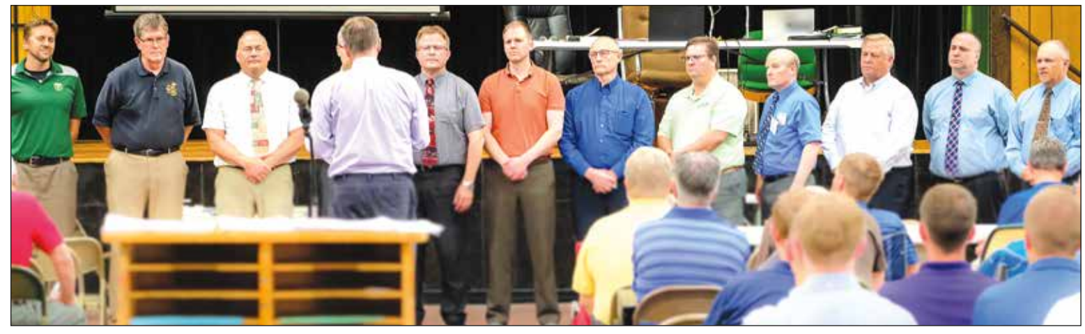
Above, newly elected officers and board members of the CLC are installed on the last day of convention.

documents be made available by being posted on the CLC website, . . . and that the Board of Doctrine report to the 2022 Convention as to the status and general framework of this registry."