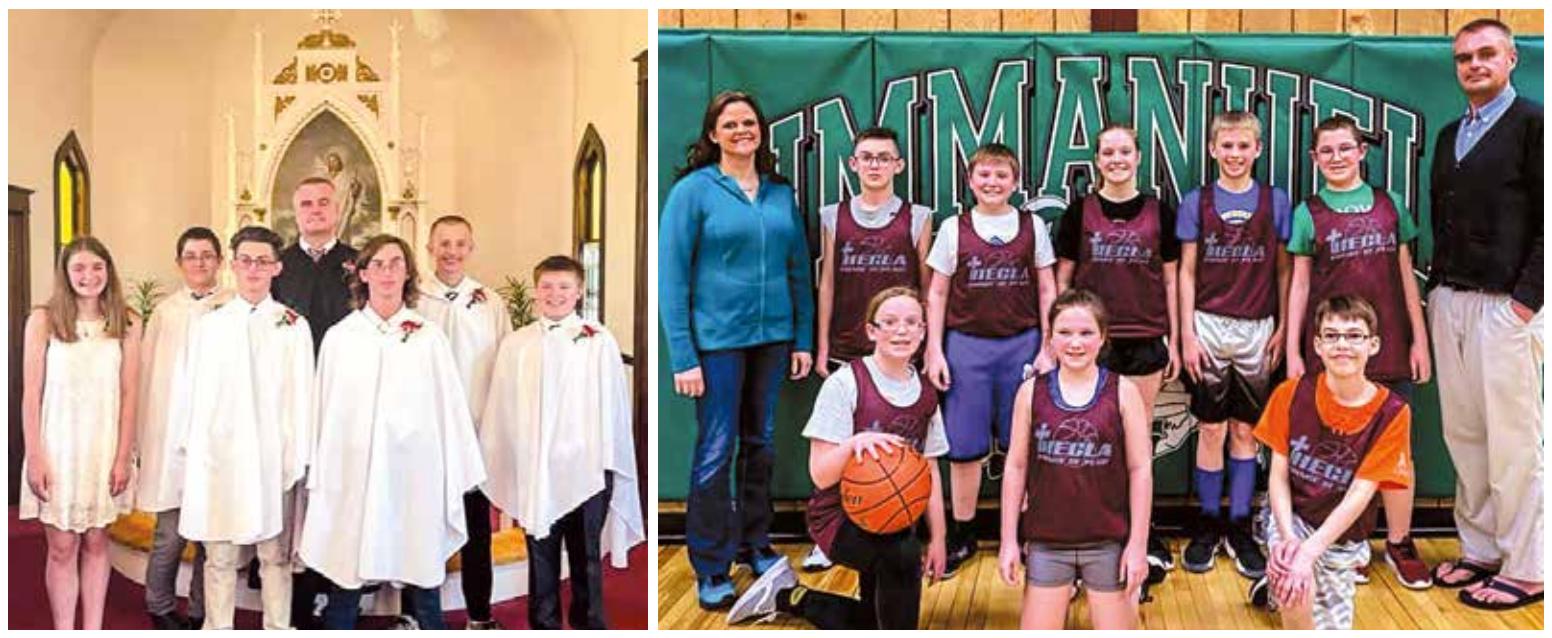
Left, Confirmation Sunday. Right, the Hecla youth basketball team at the grade school tournament in Eau Claire. Below, a Baptism at Prince of Peace Lutheran Church.

happen, and with all our recent activity, Prince of Peace is now the talk of the town in a way that the Lord is using for His gain: "And this rumour of Him went forth throughout all Judaea, and throughout all the region round about." (Luke 7:17 KJV)