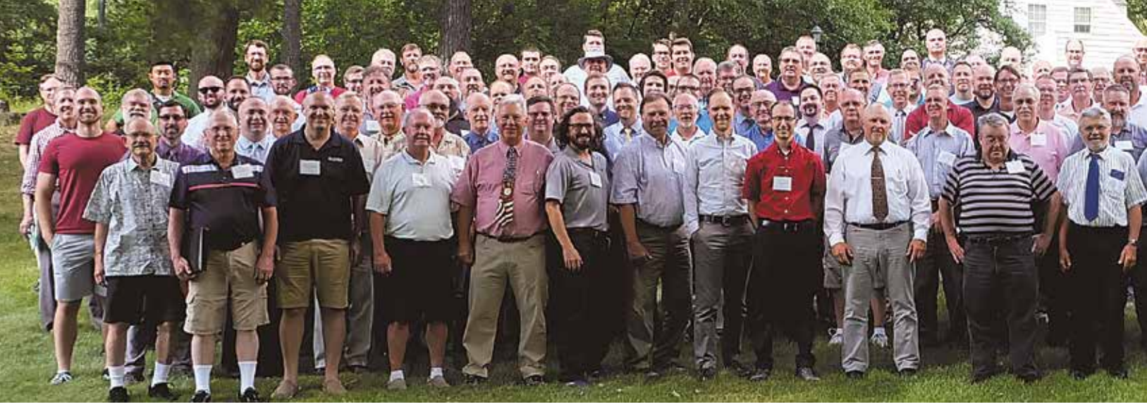
Above, pastors, teachers and delegates gather for the traditional group photo on the hillside near the Immanuel College fieldhouse. Below, a floor session in progress.