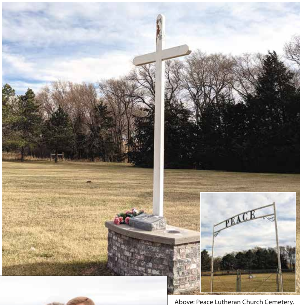
Inset: Cemetery entrance. Left: Shay DuBray and Tate Jackson were