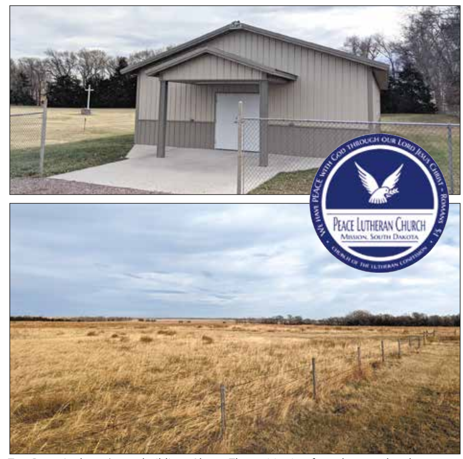
Top: Peace Lutheran's new building. Above: The prairie view from the new church.

Not long after completing the church, a bell tower was constructed. That new bell now fills the prairie each Sunday morning with the announcement that worship is