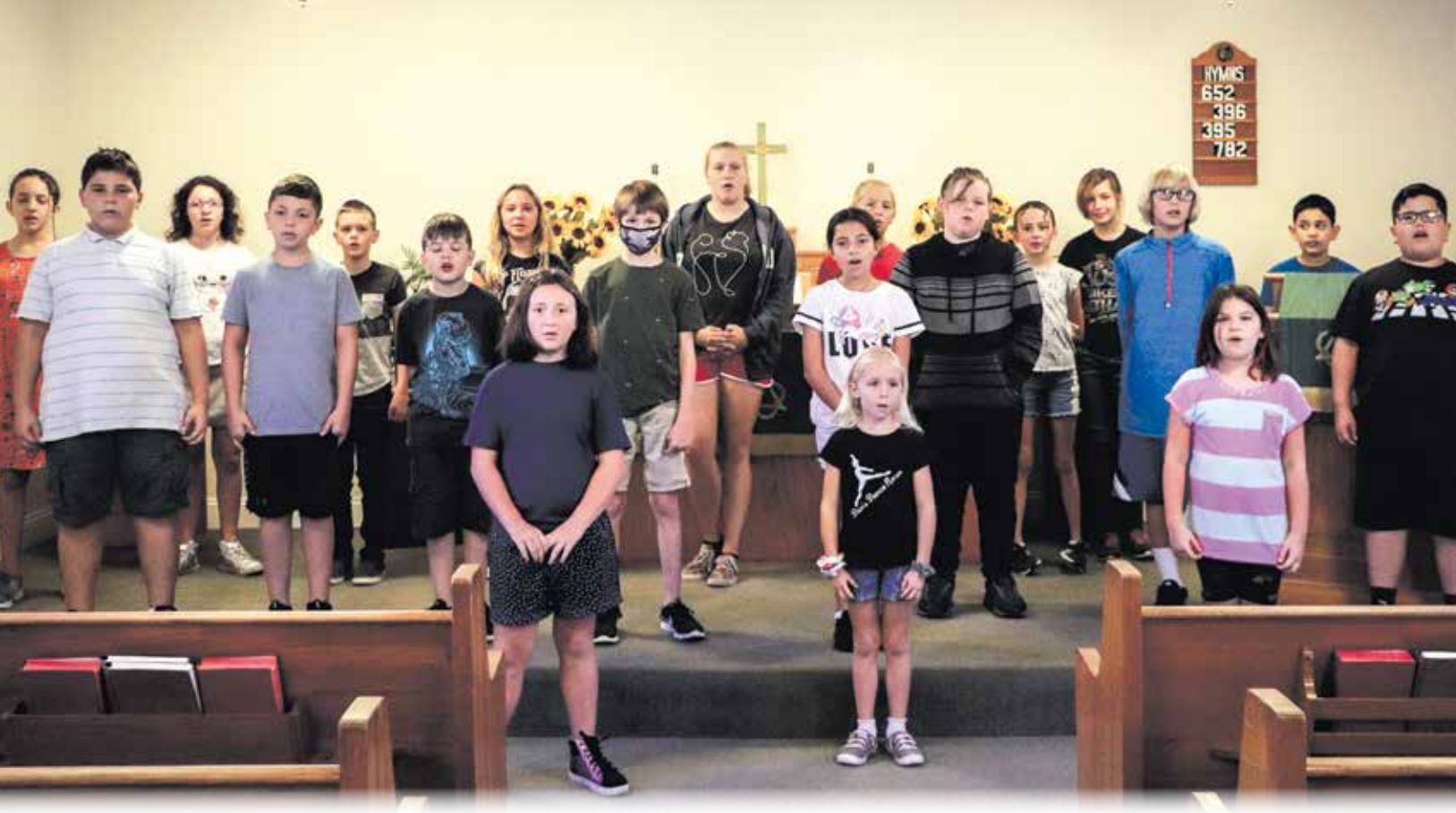
Students singing at Immanuel Lutheran Church and School in Winter Haven, Florida. See more on pages 10 & 11.