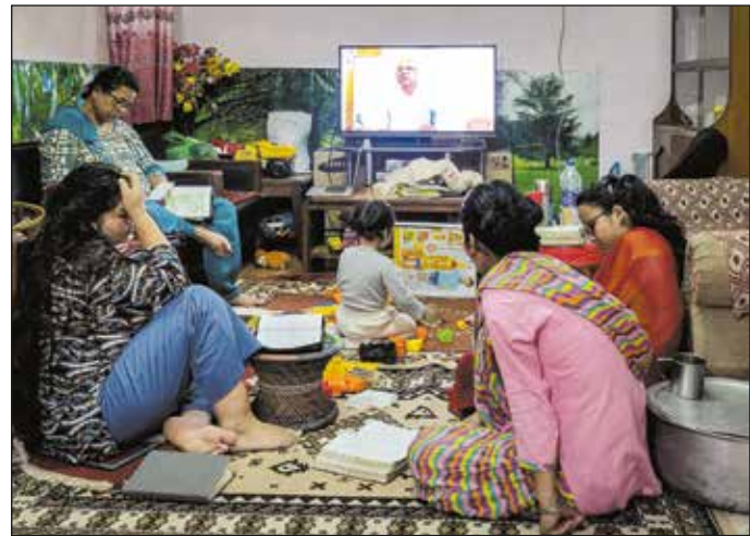
Above, a Nepalese family gathers for remote worship during the COVID crisis. Below, musicians warm up for a socially-distanced service. Opposite, congregants say a prayer of thanks for food aid provided with CLC support.

Regarding the Himalayan Bible Institute (HBI), we had completed courses at two HBI locations—one in