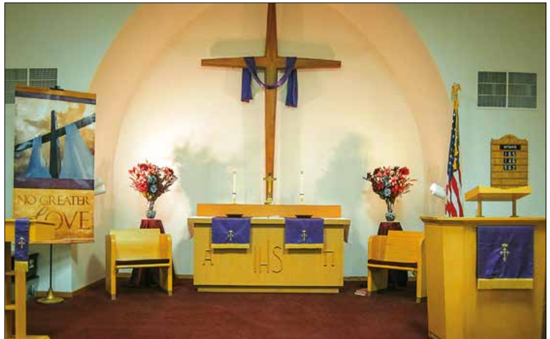
Top: Gift of God ladies' group with a craft project. Above: the chancel.

About three or four years ago our congregation began a ministry to support young people who attend the local colleges (North Dakota State University, Minnesota State University Moorhead, and others). During the school year we meet on the NDSU campus once a month for Bible study time and just an overall gathering together around the Word. This study is proving as much a blessing for the leader as it is for the college students! Every year for the past five years, on the second Friday in December, we hold a CBS (Christmas Bible School). We have gotten quite a number of parents who drop their children off at our church and we teach them a Christmas Bible story and do an engaging craft. It is really a festive and fun experience, and we take the calling from our Lord seriously that we as big people are to lead the little people to Jesus.