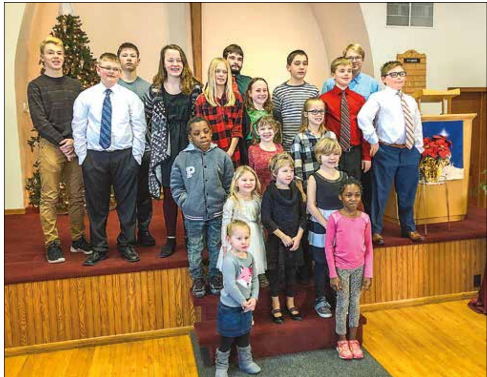
Gift of God's children's Christmas Eve service, 2018.

Mapleton was platted in 1876, soon after the railroad was extended to that point. The city took its name from the Maple River. A post office has been in operation at Mapleton since 1875.