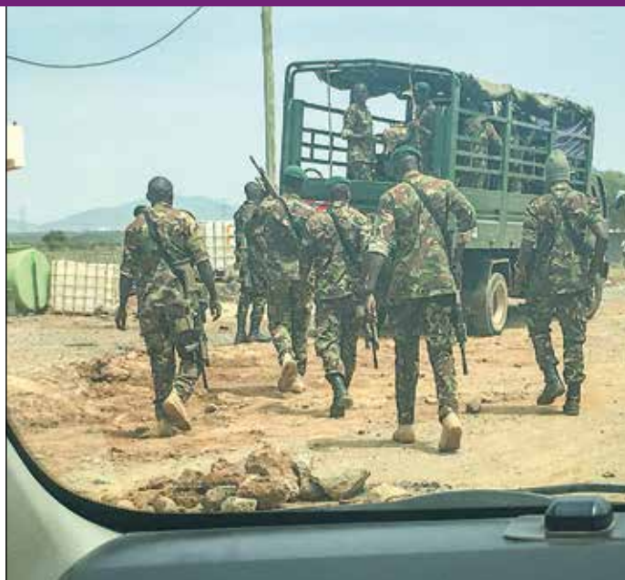
Above: Kenyan soldiers dispatched to dismantle a roadblock.

We didn’t get a definitive answer as to why they were doing this, but the story told was that the road in front of their school was dangerous and more than a few people had lost their lives in vehicle crashes there. They wanted to get the attention of the local government, and the teacher of this school thought that this was the best way. So we waited—and waited. Two hours passed. Suddenly, Kenyan men in fatigues and wielding military rifles were filing past our car. A few orders barked from the man in charge forced bodies into motion and the stones were cleared away in minimal time.