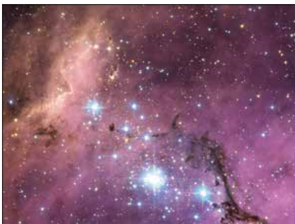
Large Magellanic Cloud, one of the nearest galaxies to our own Milky Way, as seen from the Hubble telescope.