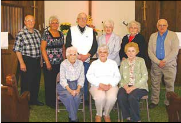
Top: Bethel sanctuary. Above: charter members of the congregation.

the congregation's certificate of incorporation is January 11, 1961.