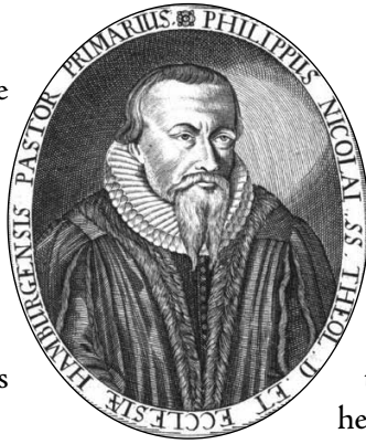
Philipp Nicolai was a German Lutheran pastor, poet, and composer. He is most widely recognized as a hymnodist.

For life in the midst of all this death, Nicolai turned to the Word of God, especially the promises of eternal life in Christ. And from his studies of these passages came a book of devotional meditations called Freudenspiegel ( Mirror of Joy ), an expression of his hope of eternal life. His stated purpose in writing it was that it would be a witness of his faith should he also be taken by the plague. And if it were God’s will that he should survive, he would use it to comfort grieving members of his congregation. In the preface to this work, Nicolai wrote, “There seemed to me nothing