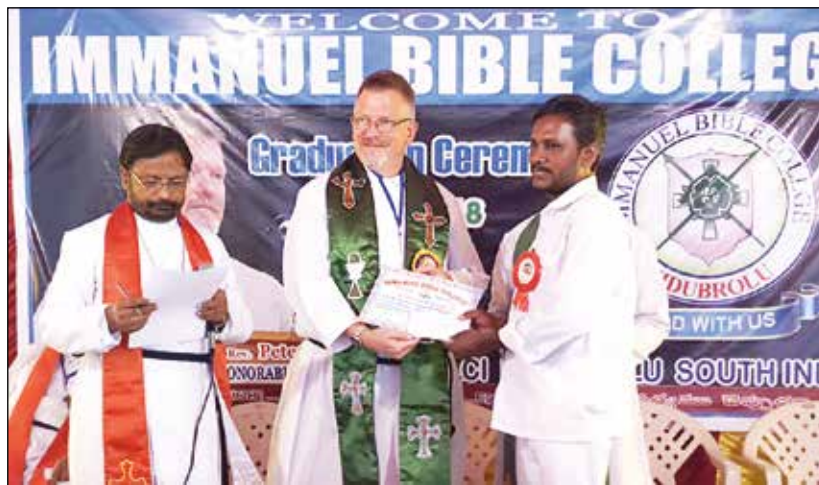
A student is awarded a certificate upon completion of the CLCI Bible Correspondence Course.

We are happy that many of our Hindu and Muslim friends are also taking this Bible correspondence course from us. We will not give out any information about them to anyone.