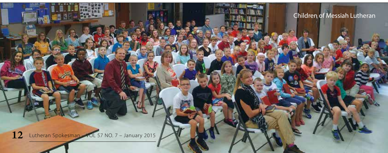
Children of Messiah Lutheran

The Lord has blessed Messiah with steady growth throughout its history. Our church membership has recently exceeded 800 souls. Our school enrollment in Pre-K through 8 th grade is 133 students. As the needs arose, the Lord blessed us with the means to accommodate the work at hand. The list of building projects from past years includes classroom expansions, two parsonages and one teacherage, and a fellowship hall. A major project in recent history was the building of a new sanctuary, which was dedicated in April of 2007. Along with the needed property expansion, the Lord has provided called servants to serve the church and school. Messiah Lutheran School currently has five full-time teachers, and five who serve part time. Our ministerial staff has recently been increased to three full-time pastors. Beyond the work of our called servants, there are countless tasks and responsibilities that are faithfully performed, on a volunteer basis, by