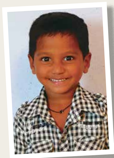
One of the children cared for at the Nidubrolu compound