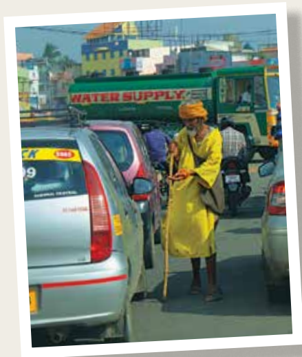
A beggar working taxis at a stoplight — poverty is never far away in India

In this series, those involved with our CLC foreign missions profile one area of our overseas endeavors.