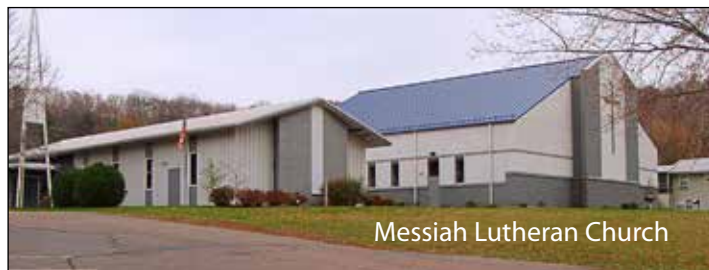
Messiah Lutheran Church

In the fall of 1963, Immanuel Lutheran College began its first school year in Eau Claire. Throughout the years, Messiah and Immanuel have had a very close relationship. Messiah has had the privilege of serving as a "home away from home" church for the students. In addition, dozens of student practice teachers and seminary vicars have come to Messiah Lutheran Church and School for observation of and practice in the public ministry. Messiah's members have been grateful for the