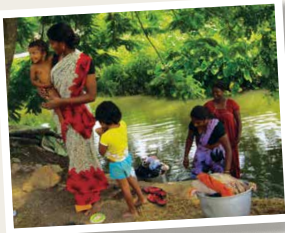
A canal near the compound in Nidubrolu is handy for washing clothes - and babies!

Over the next few days, Missionary Starkey and I were honored to be the guest speakers at worship services in several area CLCI