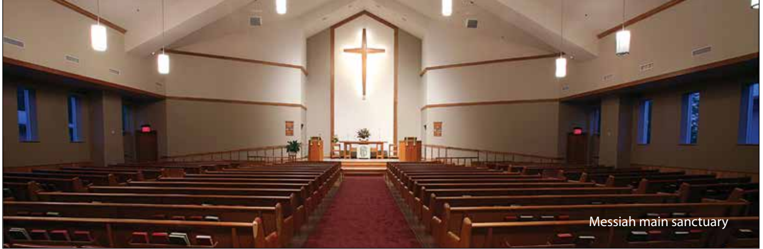
Messiah main sanctuary

our members. We owe it all, of course, to the work of our gracious God. He has not only provided eternal life through the death of His Son in our place, and called us to faith through His inspired Word, but has also moved the hearts of our members to serve Him for the growth of His kingdom.