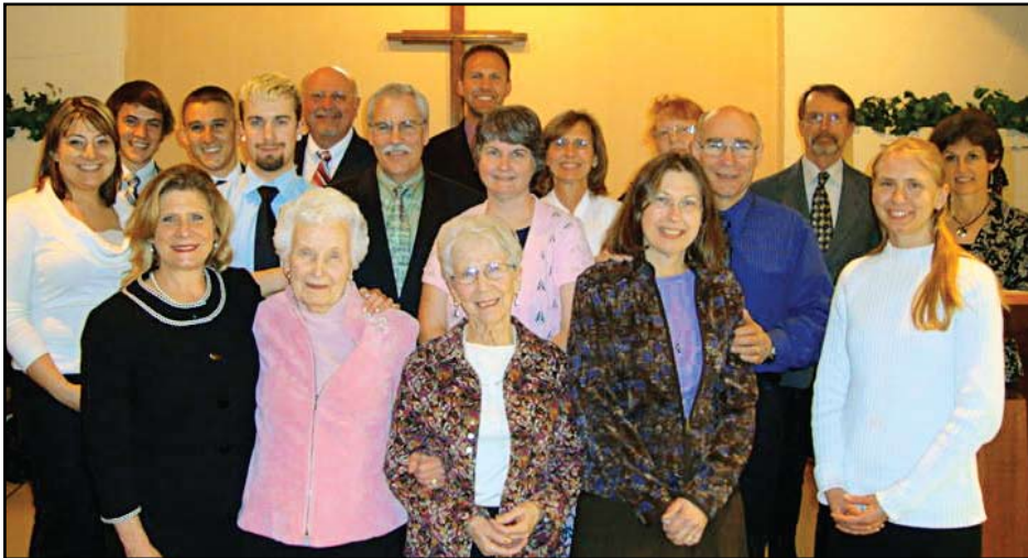
See "Installation" in announcements on (page 18)