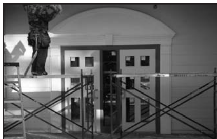
The new AC rafters were raised and the ceilings were finished.

found in Reim Hall and the Cottage. The value is to be found in what is done within those walls and halls.