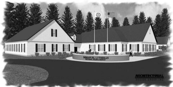
Architectural drawing of the new Academic Center at ILC, Eau Claire