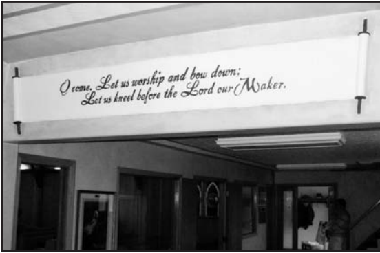
A remodeled narthex has this overhead “scroll” to welcome worshipers to Trinity Lutheran Church, Watertown, South Dakota.

owns a gas station/convenience store and casino near the entrance to our city has revealed plans to establish a business which sells adult literature. It appears that there is nothing that the city can do (or is willing to do?) to stop this business.