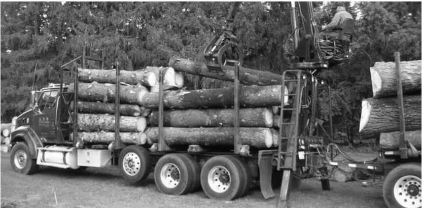
Harvesting lumber as the way was cleared for the new ILC Academic Center

The sacred text is spare of extra verbiage, recounting that Isaac "took