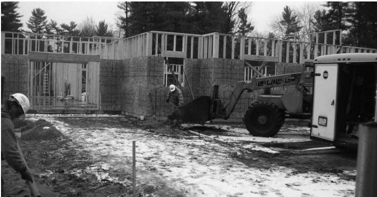
New Academic Center walls went up in spite of winter weather.

We should not join together in fellowship with those who are not agreed on the teachings of Scripture. We can foster the unity of Christ's Church here on Earth only through faithfully teaching and preaching all things Christ commanded and not through unionistic worship, which will never resolve the doctrinal differences between the vari-