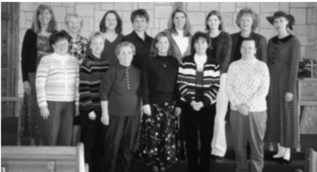
Women's Group, St. Paul Lutheran Church, Bismarck, North Dakota