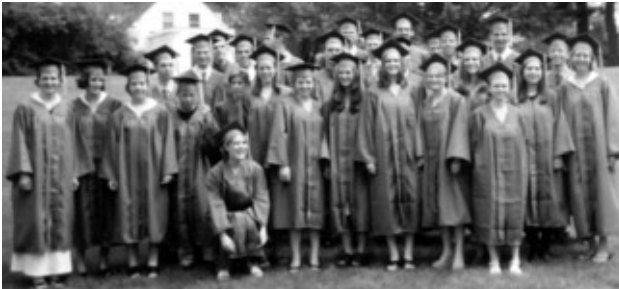
Immanuel Lutheran High School Graduates

No seminary or teacher graduates were presented to the Church, but two young men were graduated from the four-year pre-theological course and