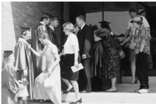
Faculty Congratulates ILHS grads.