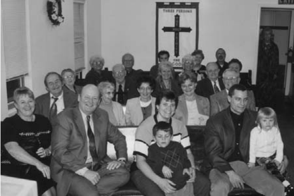
November 3, 2003 anniversary worshippers in the Loveland chapel (one side).