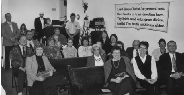
Other side of the aisle (full story, p.18)