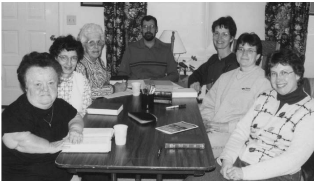
Women of Prince of Peace (WOPOP) in meeting, with their Pastor.