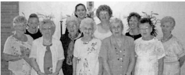
Ladies Group of the congregation, Church of the Lutheran Confession, North Port, Florida.