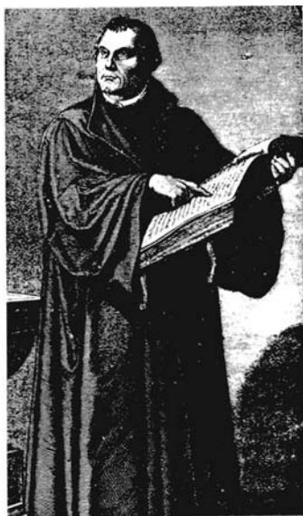
"THE SCRIPTURE CANNOT BE BROKEN" JOHN 10, 35

Similarly, it was not long after Luther died that man's ideas started to creep in one after the other.