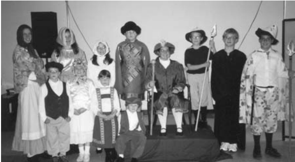
For Reformation 2002, children from the Colorado Front Range churches (Redeemer, Cheyenne; Prince of Peace, Loveland; St. Paul's, Denver {Lakewood}) presented a Reformation Tableaux. Luther (2nd from right) and Prince Charles (seated) are surrounded by townspeople and soldiers.