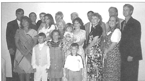
The Brice Prairie Group