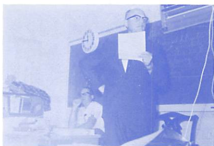
Moderator and Secretary