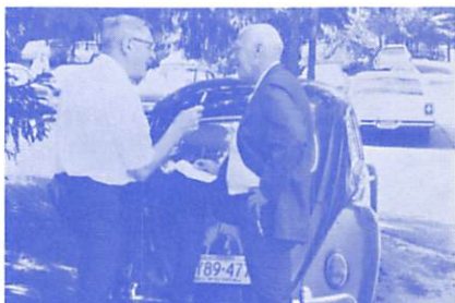
"But it makes 27 m.p.g."