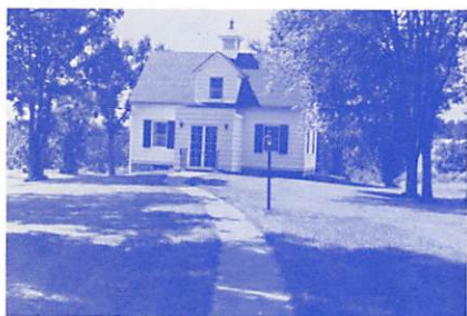
The Sem House