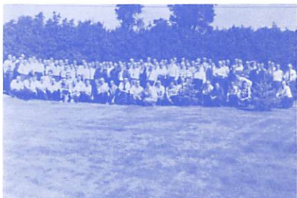
The Delegates of the CLC Convention