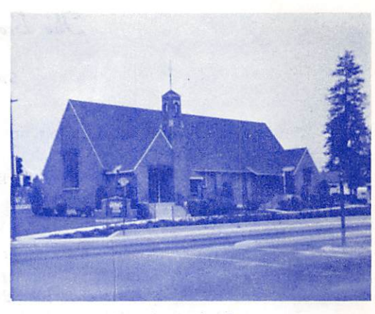
Trinity Lutheran Church

In due time there was property, and the present church building was constructed. Much patience (the war