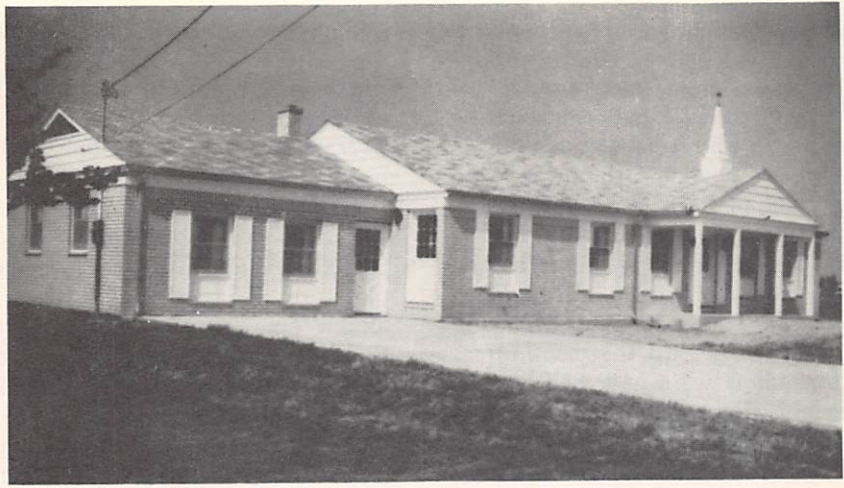
Gethsemane Church in Saginaw, Michigan