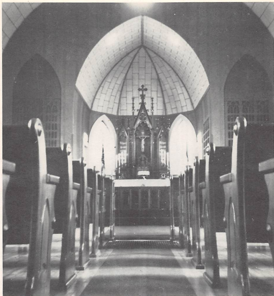
Interior of St. Paul's Church in Green Garden

had to be weighed carefully in such a historic step as this. The prime reason which caused the two churches to undertake the division of the parish was their concern for the spiritual welfare of the respective congregations.