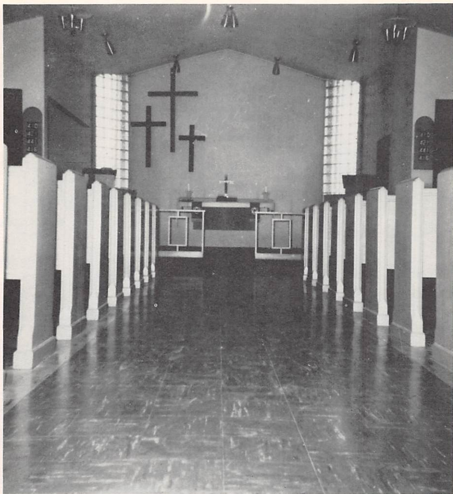
Interior of Calvary Church in Marquette

concludes: "We in Marquette invite and encourage the prayers of our CLC brethren in our behalf, that He who has begun this work among us locally will continue to sustain us with His blessings and enable us in turn to be a blessing also to those of His elect whom He has yet to draw unto Himself."