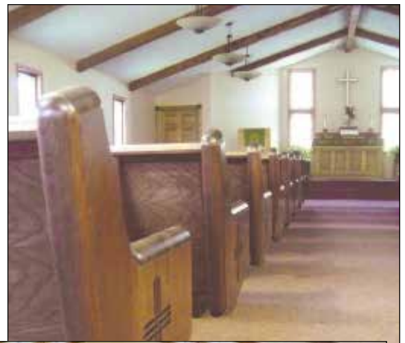
Above: Some members of the Peace Thru Christ Lutheran Church in Middleton. Right and Inset: Church sanctuary.