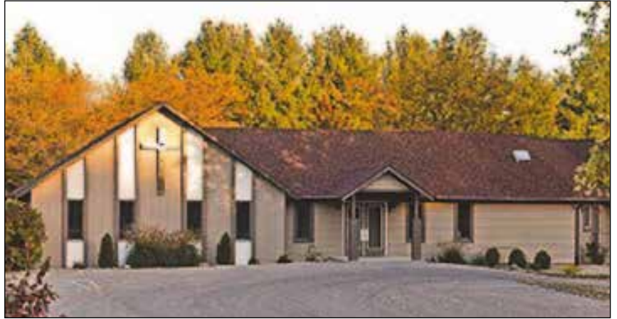
Peace Thru Christ Lutheran Church in Middleton, Wisconsin.

In August 2018 the congregation began a Wednesday morning Children's Play Group, which attracted numerous children and parents who got to know about our church and our desire to re-start our school someday. Unfortunately, because of COVID, this venture has been on hold since