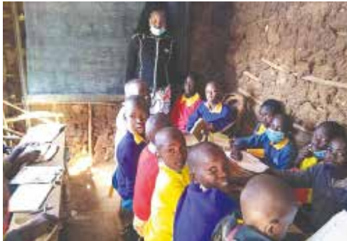
CLC-supported Lutheran school in Mois' Bridge, Kenya.