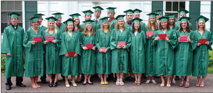
High school graduates in front of Ingram Hall