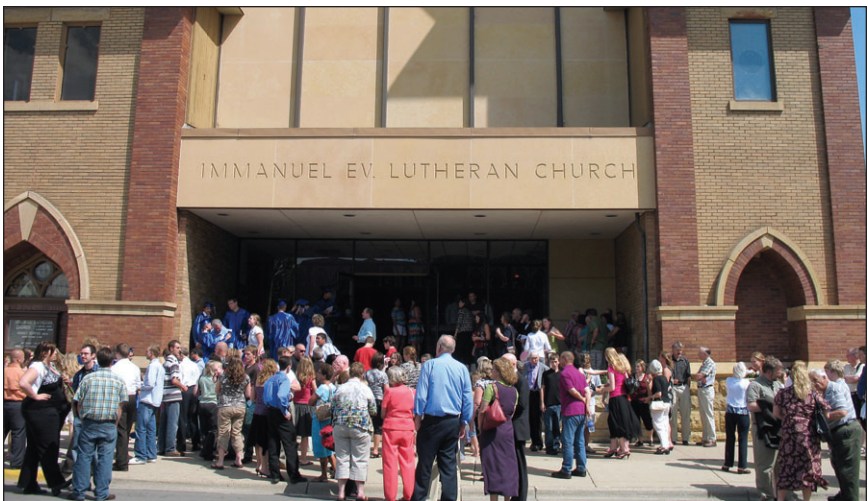
Graduation day at Immanuel Church, Mankato (see p. 18)

He had heard their confessions and expressions of regret a year earlier. Now they stood before him again—double money in hand, gifts from his father given unknowingly to his son, and his younger brother at their side.